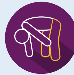
Difficulty getting up from the floor without help

The specific symptoms of Duchenne may be different for each child. Some are physical, such as falling down and walking on toes. Duchenne can also affect the brain and cause cognitive symptoms, like speech delay or attention-deficit/hyperactivity disorder (ADHD).