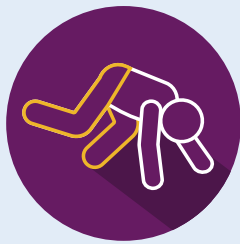
Falling down often